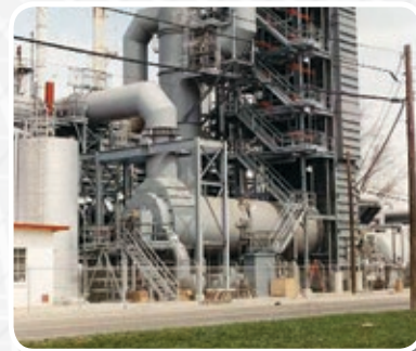
Carbon Monoxide Boilers

ZEECO® combustion and environmental solutions are designed and manufactured to comply with applicable local and international standards as defined by our customers.