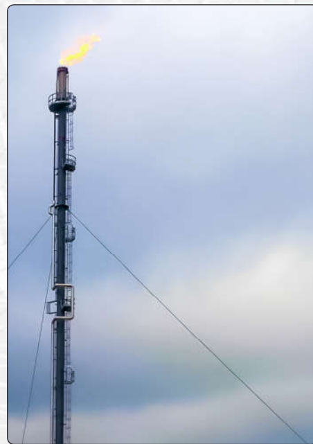
Proper application of steam allowing luminosity in the flame and full combustion