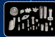
PARTS & SERVICE