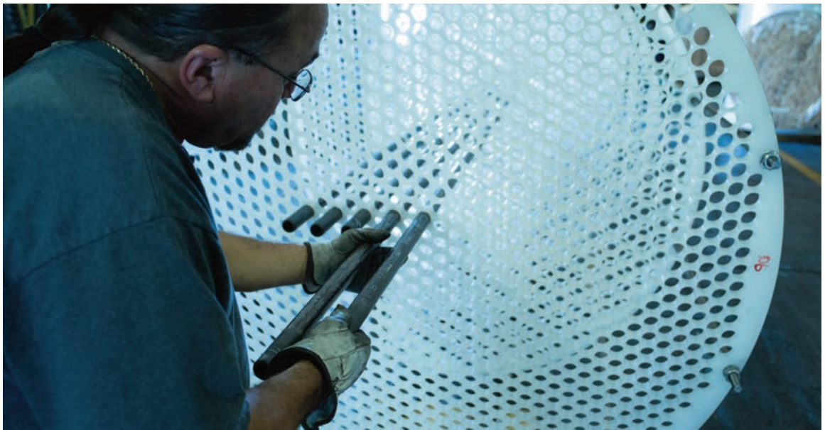
Mersen Service Centers provide complete retubing and rebundling of Heat Exchangers.